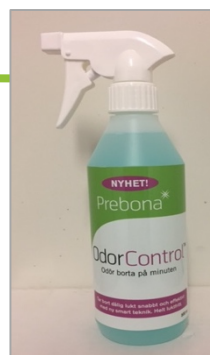
Prebona OdorControl spray bottle.