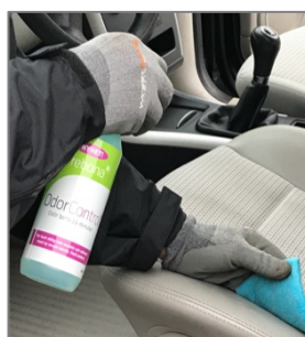
2. Apply on textiles and wipe off leather and hard surfaces.