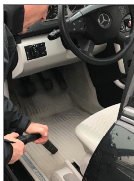
1. Clean the car interior.